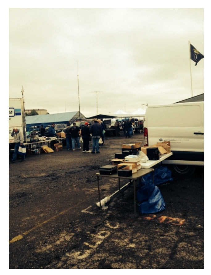
1400 local time Saturday May 21, 2016, Dayton Hamvention flea market Hara Arena Dayton OH